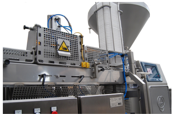
TVM 260 with optional trays conveyor belt with single trays denester. Possibility to have a tray loading + buffer and a paper interleaver.