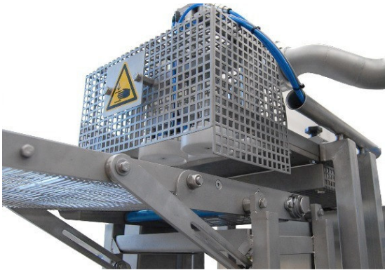
Detail of double forming head